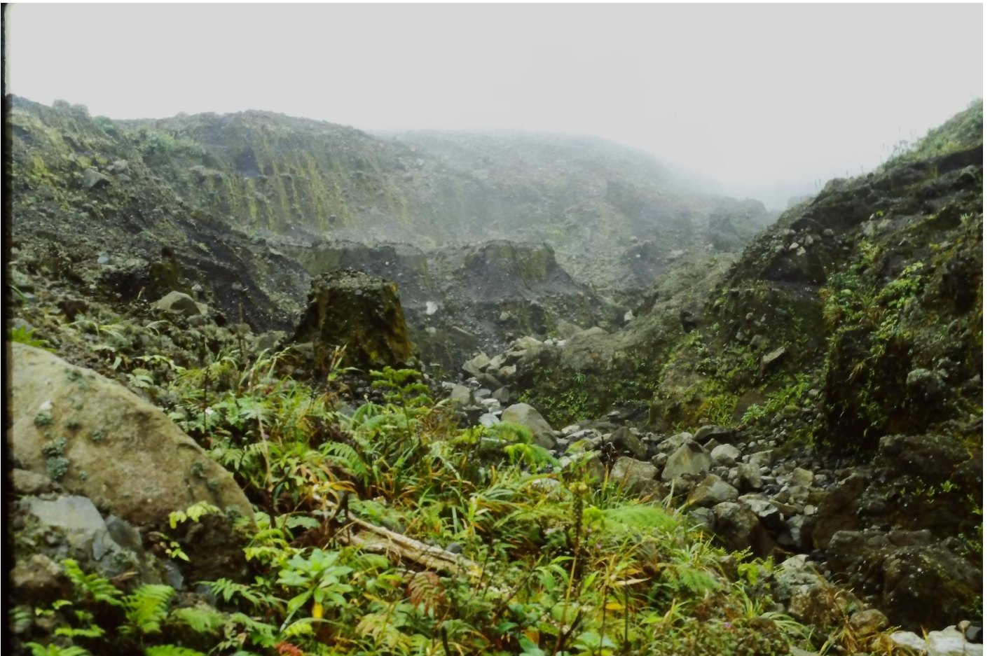
The climb to Soufriere

We took a couple of hundred slides when we were in St. Vincent and I took a few prints as well. The slides have been transferred to a digital image (not great, some of them) but they give you a flavour of what life in St. Vincent was like. (They are in no particular order)