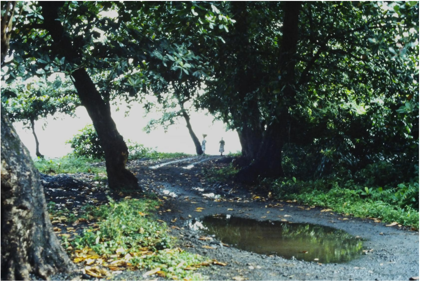
Richmond was on the Leeward coast - a starting point for a hike to Soufriere