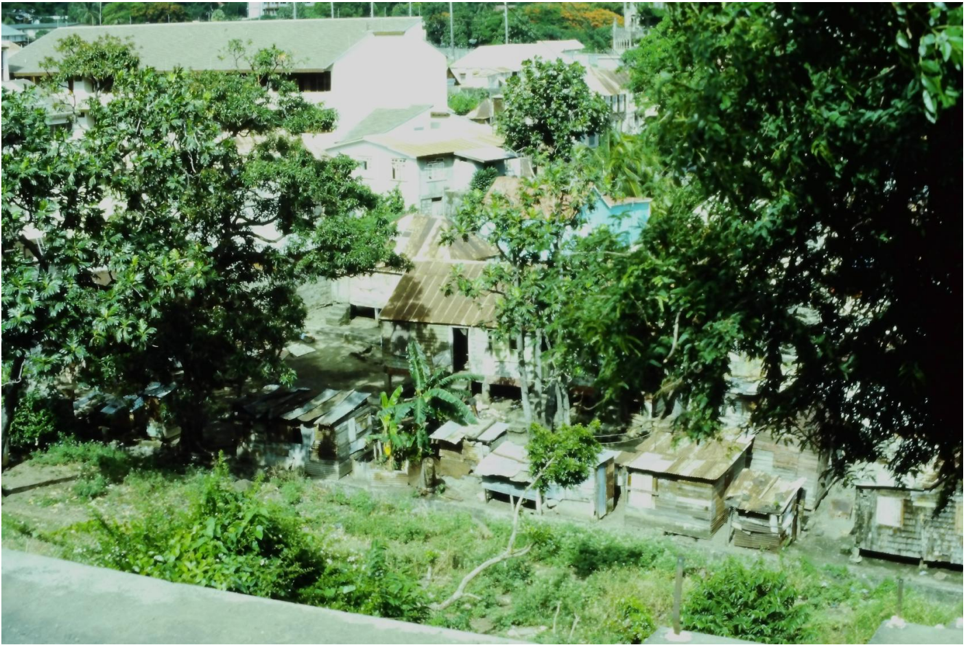
Some of the housing in lower Kingstown. That is the hospital in the background.