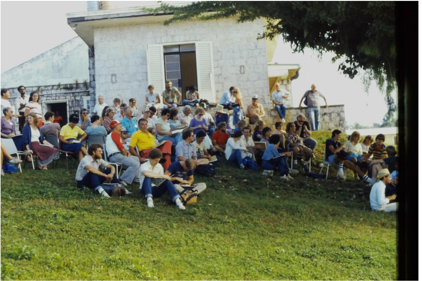
The Training Centre in Sligoville, Jamaica