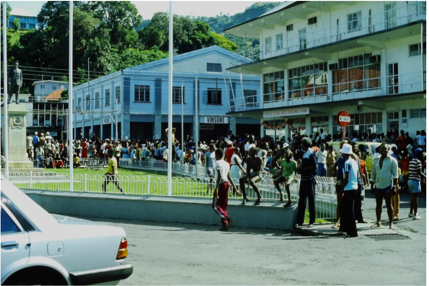
Downtown Kingstown for the SVG Marathon