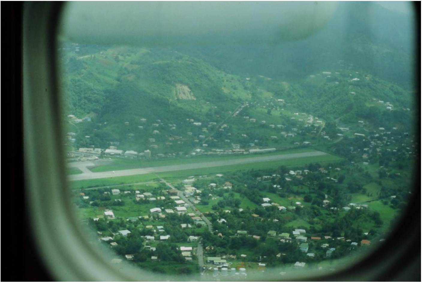
Arnos Vale Airport in St. Vincent - notice the road that cuts directly across the runway!