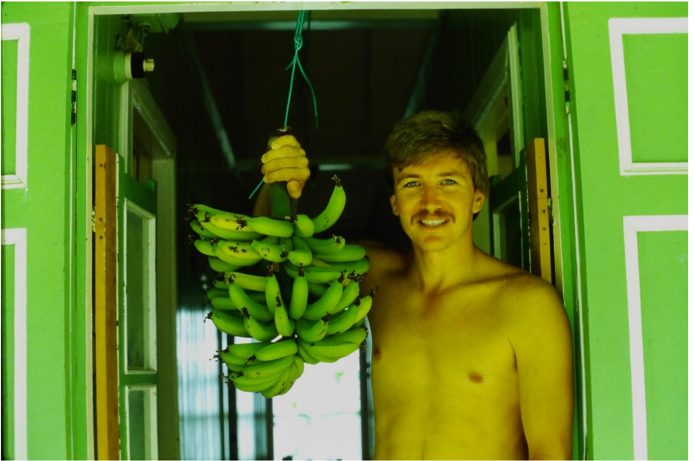
Our one and only attempt at growing bananas.