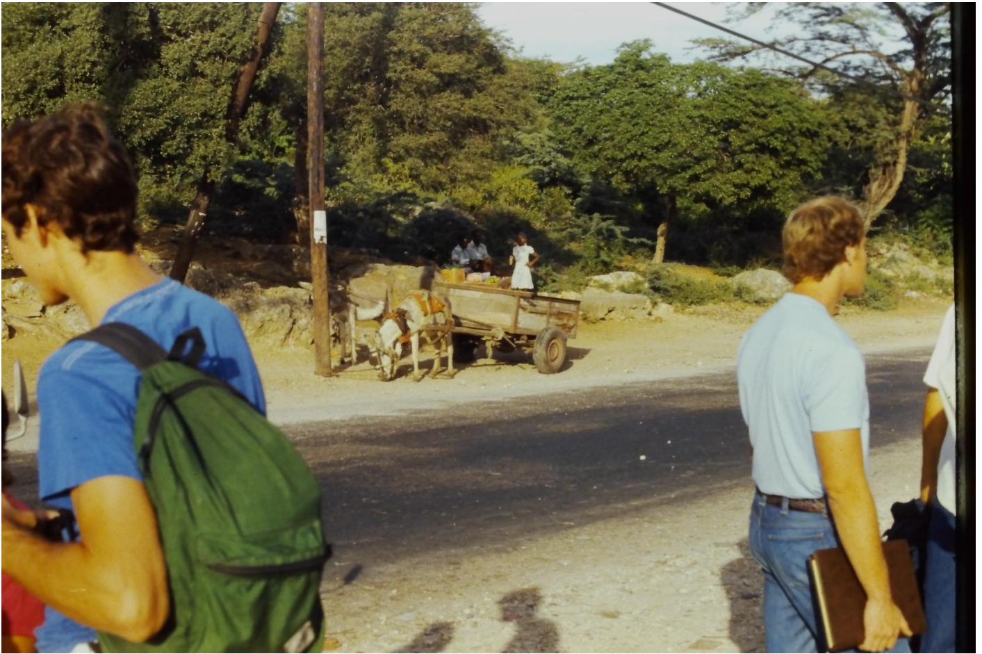
Spanish Town, Jamaica - where our homestay was