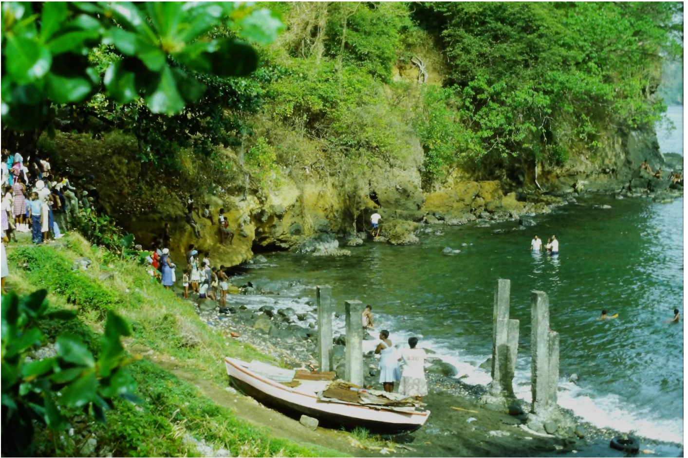
The "beach" in front of our house was sometimes used for baptisms (Shakers, in this case)