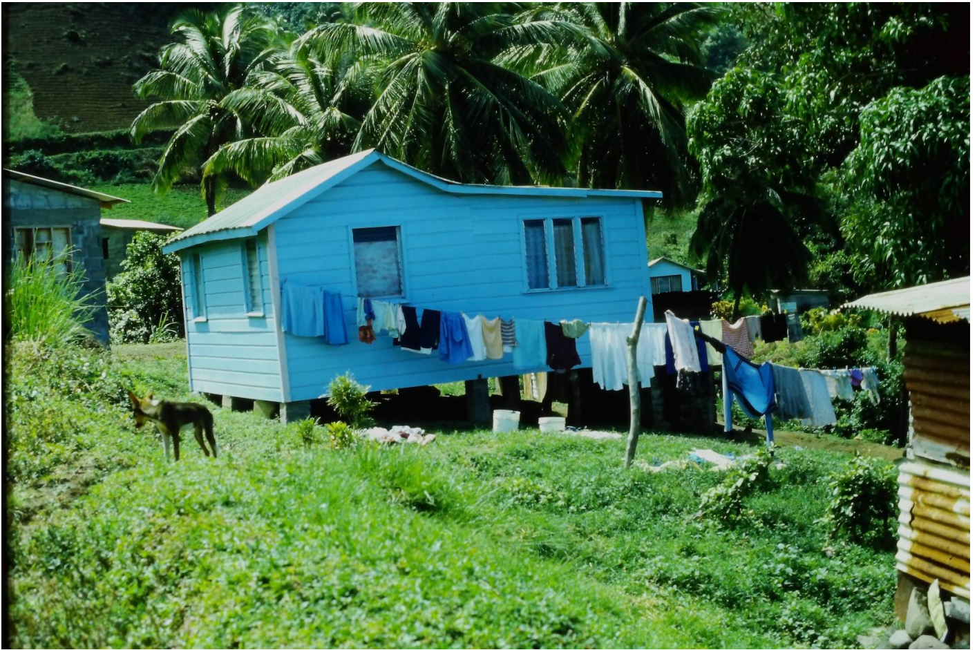
Typical Vincentian housing. This one in Sandy Bay.