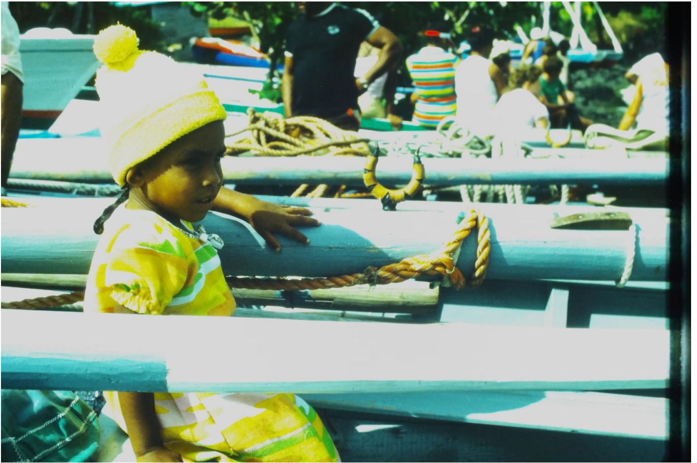
At the whaleboat blessing in Bequia