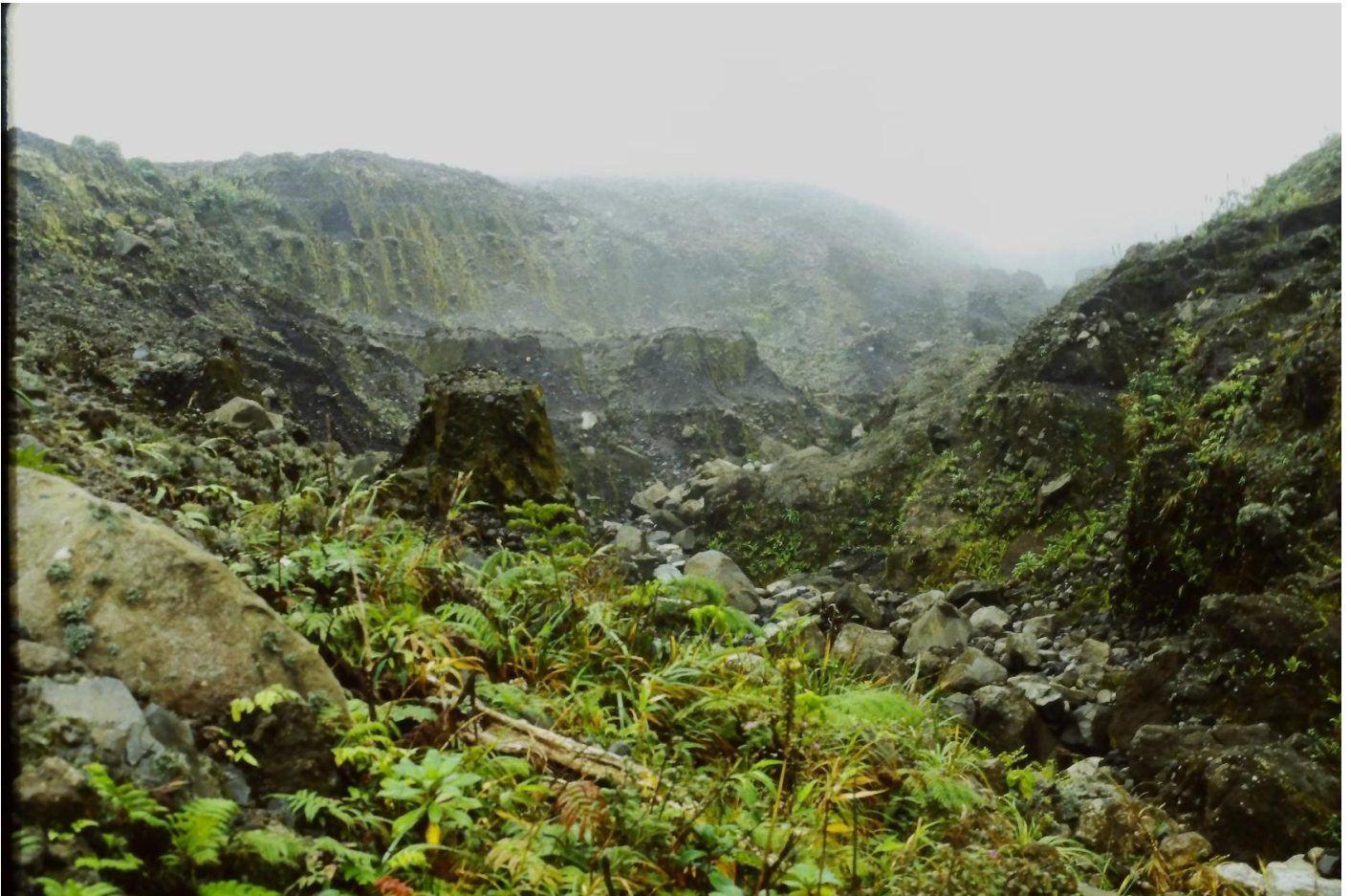
The climb to Soufriere

We took a couple of hundred slides when we were in St. Vincent and I took a few prints as well. The slides have been transferred to a digital image (not great, some of them) but they give you a flavour of what life in St. Vincent was like. (They are in no particular order)