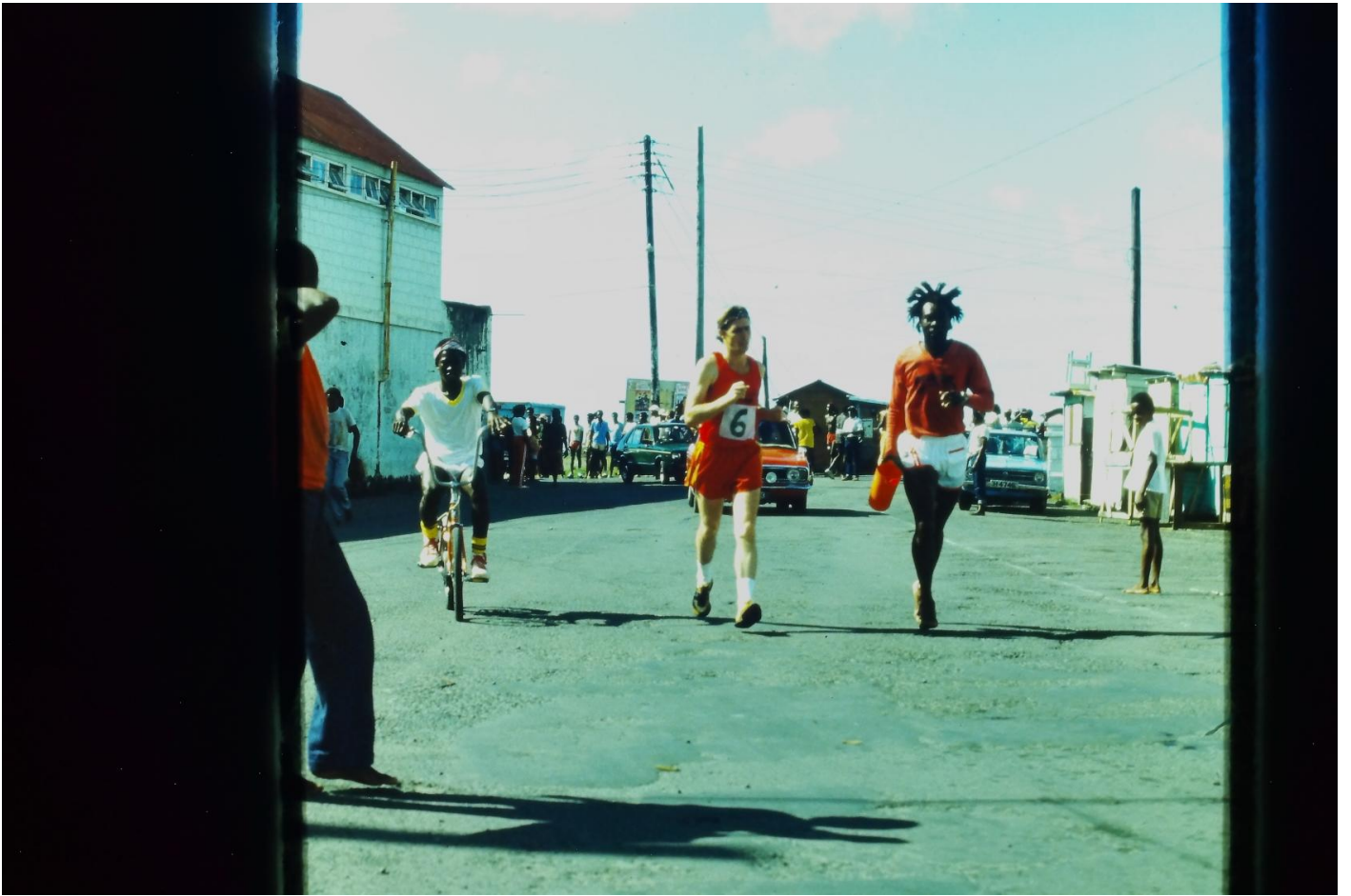
Runners in the Marathon