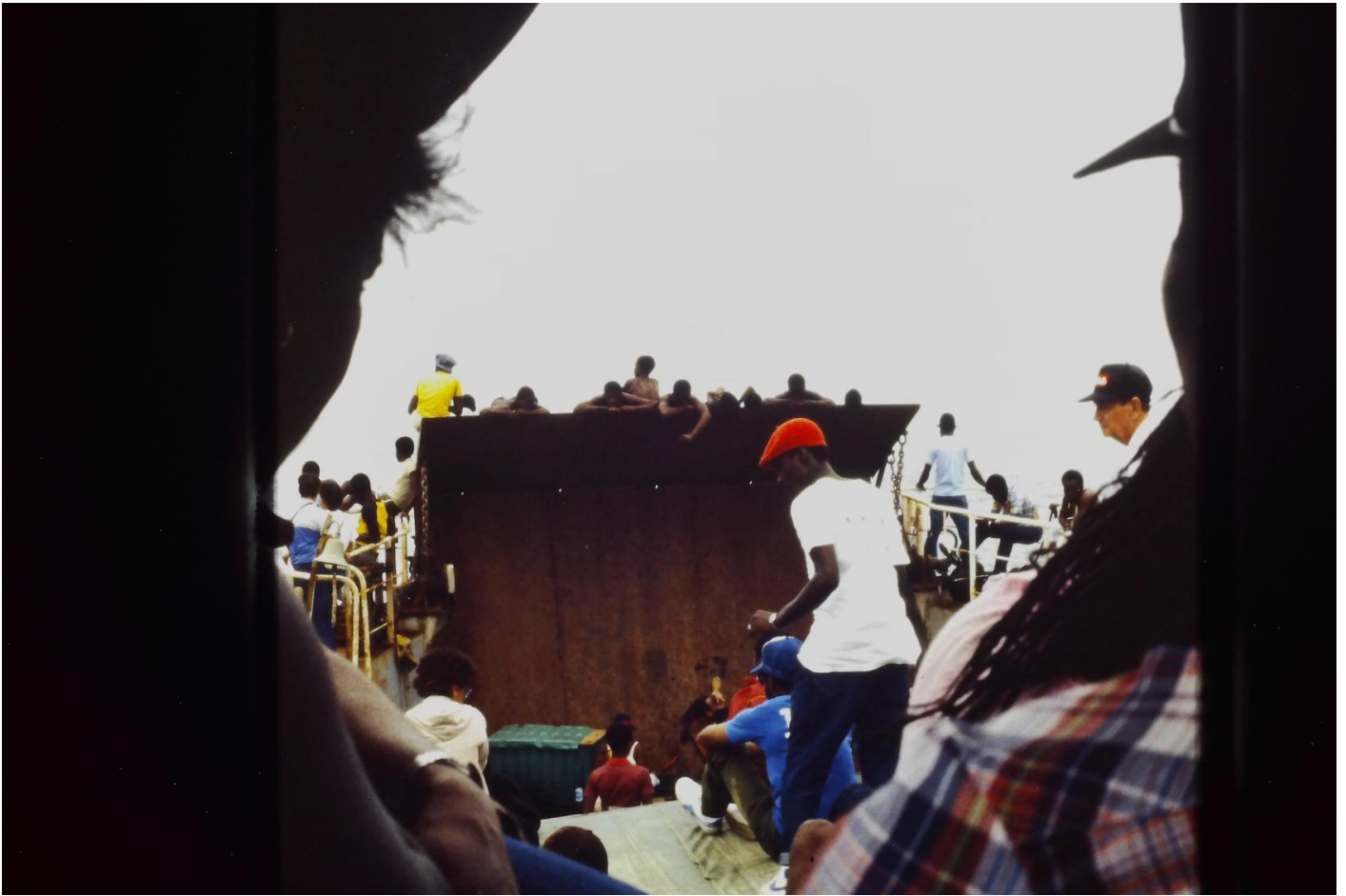
There was a LST from WW II that was used for sea transport for "excursions" (trips). This one was to Mustique