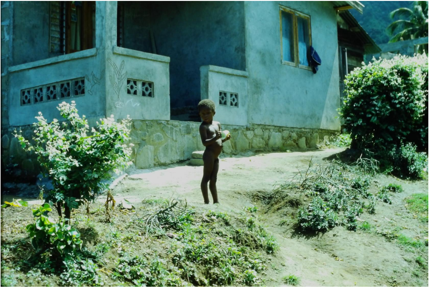
A boy at his home in Fancy, a far north village of most Carib natives.